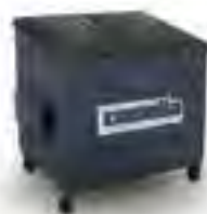
COMMERCIAL TRASH & RECYCLING