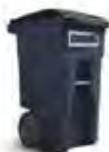
CURBSIDE TRASH & RECYCLING