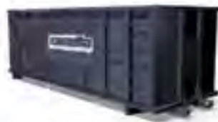
EASY & CONVENIENT DUMPSTER RENTALS